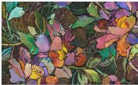
Glass Mosaics ... news.artnet.com