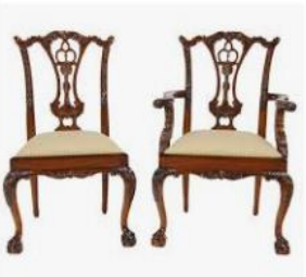
Standard Chippendale Chairs, Set ... niagarafurniture.com