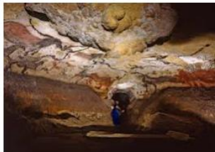
Famous Lascaux Rock Art of France Come ... ancient-origins.net