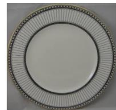
Wedgwood Colonnade-Black C... classicreplacements.com