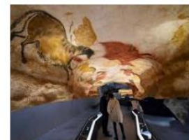
Lascaux cave paintings show concern ... torontosun.com