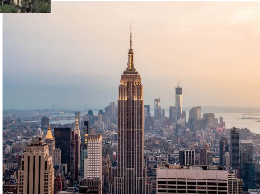
Empire State Building, New York