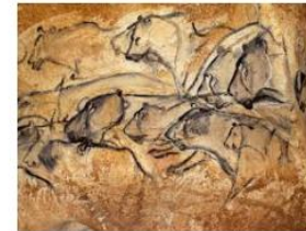
The Cave Paintings of Lascaux: Field ... thalo.com