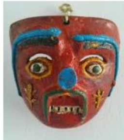
Old Peru wood mask – Ma... masksoftheworld.com