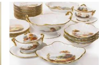
Wedgwood China: Price Guide and Popular... invaluable.com