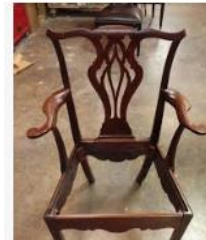
How to Identify Chippendal... aaronstouchup.com