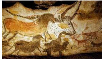
Lascaux cave paintings discovered