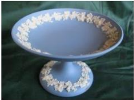
231 best Wedgwood China images o... pinterest.com

was a fine china, porcelain, and luxury accessories company founded on 1 May 1759 [1] by English potter and entrepreneur Josiah Wedgwood .