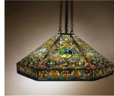
exhibit shines at Cincinnati Art Mus... moversmakers.org