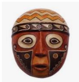
Ceramic Mask Inspired by W... novica.com