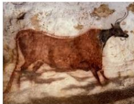
Lascaux Caves meros.org