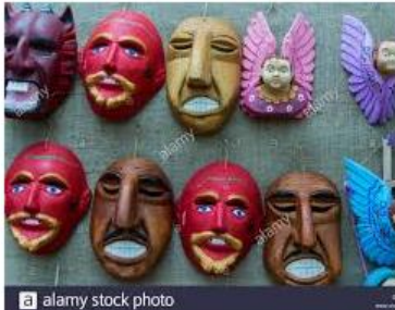
Peruvian handicraft .Peru.Wooden mas...