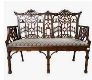
Chippendale Furniture ... decorartsnow.com