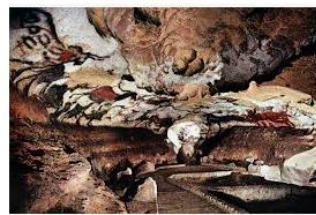
Lascaux Cave sacred-sites.org