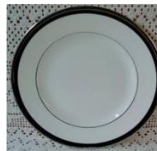
Wedgwood China, Reflection 501... robbinsnest.com