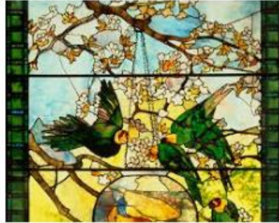
Louis Comfort Tiffany | The Tiffany ... tiffany.com