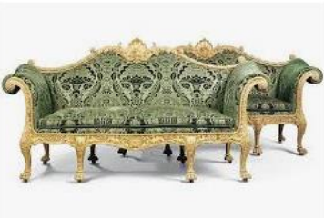
Auction Rare Chippendale Furniture ... barrons.com

various styles of furniture fashionable in the third quarter of the 18th century and named after the English cabinetmaker Thomas Chippendale . The first style of furniture in England named after a cabinetmaker rather than a monarch, it became the most famous name in the history of English furniture