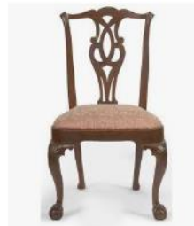
Pair of early Chippendale ... garysullivanantiques.com