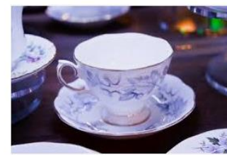
Vintage Wedgwood China | LoveToKnow antiques.lovetoknow.com