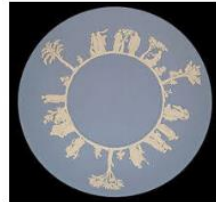
Wedgwood - Wikipedia en.wikipedia.org