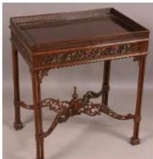
Thomas Chippendale - Eig... thecultureconcept.com