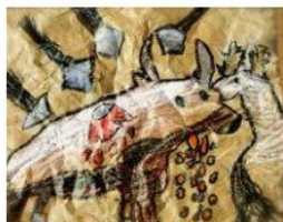
52 Best ~ Lascaux Cave Paintings ... pinterest.com