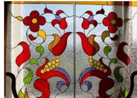
Summer. Stained Glass Tiffany – shop ... livemaster.com