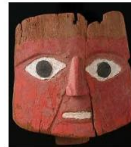
Pre-Columbian Chancay b...