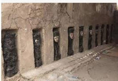
Wooden Idols Discovered in Peru livescience.com