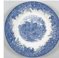
Wedgwood China at Replac... replacements.com