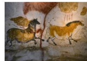
Lascaux caves: New site sheds light on ... ibtimes.co.uk