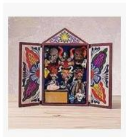
Great Deal on Wood retabl... mywedding.com