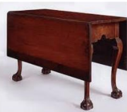
Antique Furniture theantiquesalmanac.com