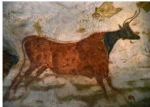
Lascaux caves: New site sheds light on ...

Lascaux is famous for its Paleolithic cave paintings, found in a complex of caves in the Dordogne region of southwestern France, because of their exceptional quality, size, sophistication and antiquity. Estimated to be up to 20,000 years old, the paintings consist primarily of large animals, once native to the region