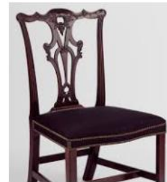
Thomas Chippendale - Victori... vam.ac.uk