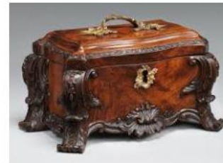
Thomas Chippendale: The Most ... cobosocial.com