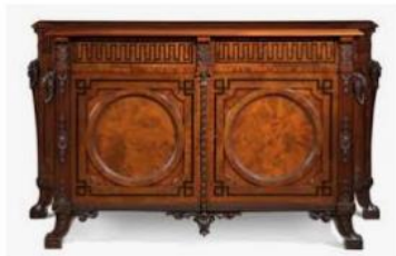
Thomas Chippendale — An expert guide ... christies.com