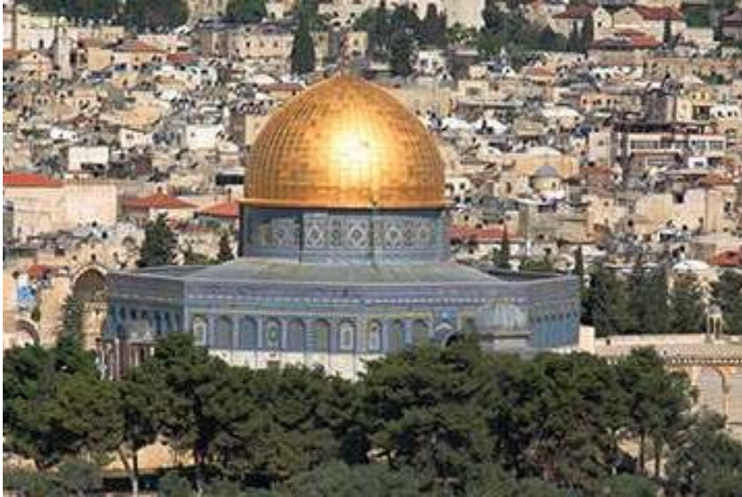
Dome of the Rock, Jerusalem