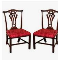
Set of Four Antique Chippe... 1stdibs.com