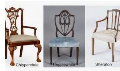
Chippendale Furniture ... decorartsnow.com