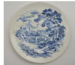
Wedgwood China | Countryside Blu... tgidirect.com