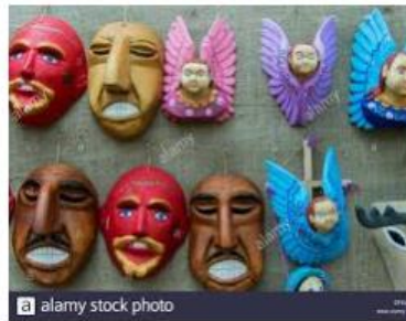
Peruvian handicraft .Peru.Wooden mask ... alamy.com