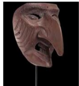
Tribal art and Mesoamerican pinterest.com