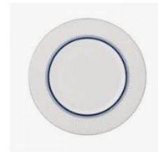
Wedgwood China & Dinnerwar... ebay.com