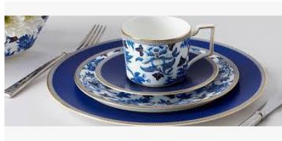
Wedgwood® | English Bone China, Fine ... wedgwood.com