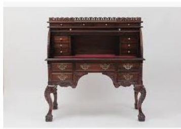
Chippendale Furniture Reproductions ... laurelcrown.com