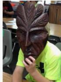
Wooden mask from Peru - ... k6art.com