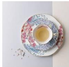
Wedgwood China Patterns & C... wedgwood.com