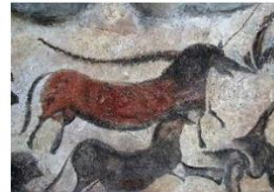
Dordogne travel guide, France northofthedordogne.com