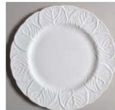
Top 20 Best-Selling Wedgwood ... replacements.com