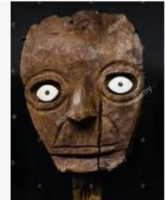
Wari funerary wooden mas...