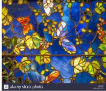
Tiffany stained glass window