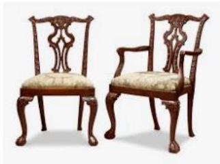
Antique Furniture, English Chairs ... rauantiques.com