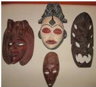
FOUR PRIMITIVE WOODEN MAS...