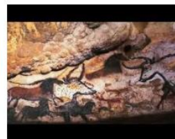
Cave Art Paintings of the Lascaux ... youtube.com