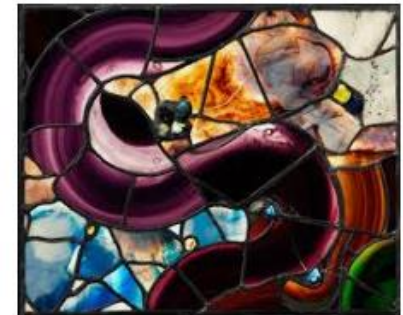
Louis Comfort Tiffany (1848–1933...