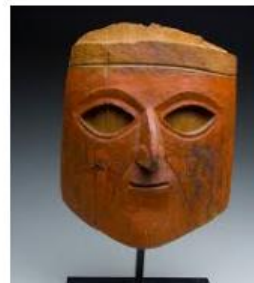
Whitehawk - Santa Fe, NM... ancientandtribalarart.com