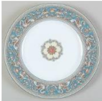
Top 20 Best-Selling Wedgw... replacements.com