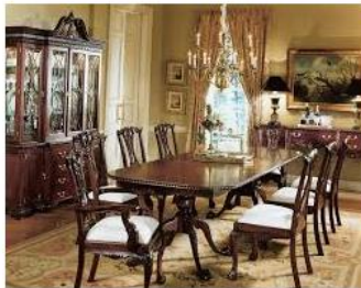
Chippendale furniture architectureartdesigns.com