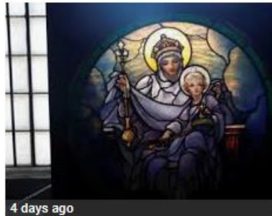
Tiffany Glass Housed in NY Warehouse voanews.com