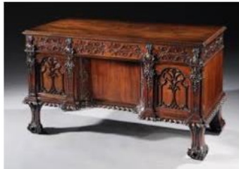
Thomas Chippendale 1718-1779 | Ronald ... ronaldphillipsantiques.com