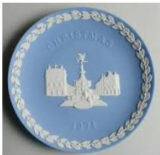
Wedgwood China, Jasperware ... robbinsnest.com