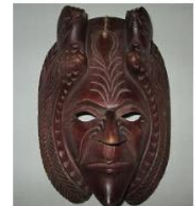
FOUR PRIMITIVE WOOD...