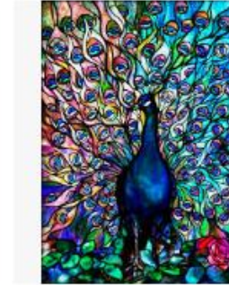
Tiffany glass exhibit at St... stuckattheairport.com