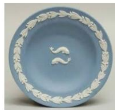
Zodiac pattern by Wedgwood C... pinterest.com