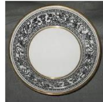
Wedgwood China & Dinner... ebay.ca