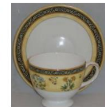
India Wedgwood China & D... ebay.com