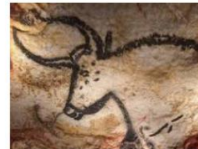
Cave Painting Centre at Lascaux, Dord...