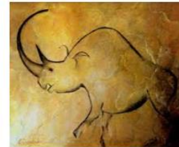
Lascaux Cave Paintings | Fine Art ... fineartamerica.com