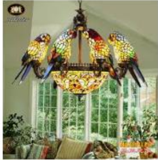
Makernier Vintage Tiffany St... aliexpress.com

refers to the many and varied types of glass developed and produced from 1878 to 1933 at the Tiffany Studios in New York, by Louis Comfort Tiffany and a team of other designers,