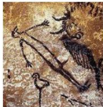
Lascaux Cave Paintings: La ... visual-arts-cork.com