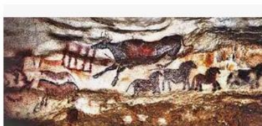
Lascaux Cave Paintings | Warehouse 13 ... warehouse-13-artifact-database.wikia.com