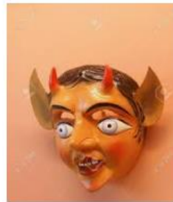
Wooden Carnival Mask, H...