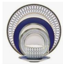
Wedgwood China Tea Sets: ... amazon.com