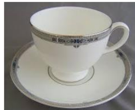
Wedgwood China, Amherst Platinum 5... robbinsnest.com