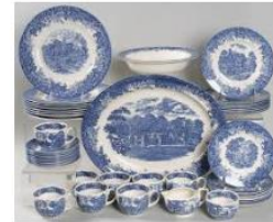
Wedgwood China Patterns | by we... pinterest.com