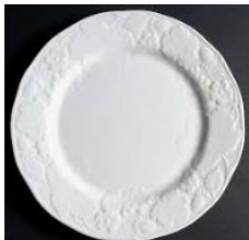
Wedgwood China at Replaceme... replacements.com